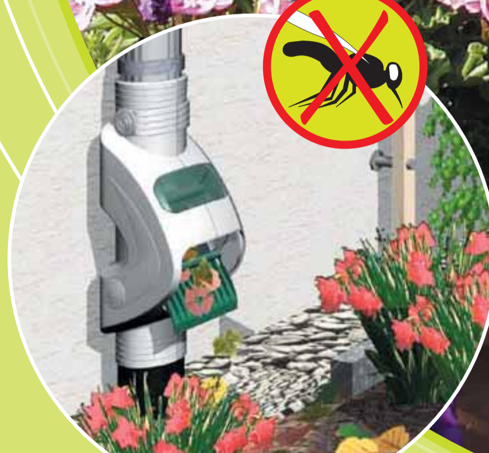
no entry for mosquitos